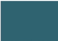
OLD TOWN GRAY

Due to variations in monitors and browsers, representation of colors may appear differently than actual colors. To confirm color, order a metal sample prior to placing metal order.